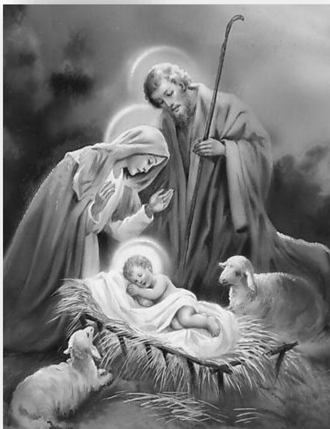
The Holy Family Of Jesus, Mary & Joseph

Parish Email: stannesbrentwood@gmail.com