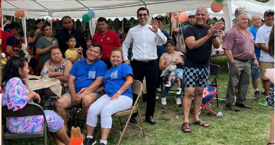
ST. ANNE'S FEAST To Be Continued...